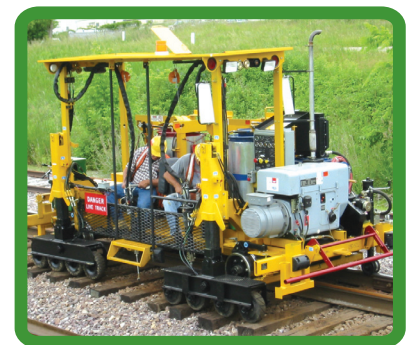
The only true ride-on tie plugger available in the market